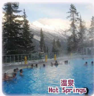
溫泉 Hot Springs

酒店Hotel: Banff International or similar 或同級