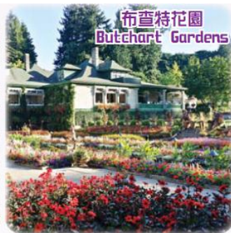
布查特花園 Butchart Gardens

(Adm Incl.) 早上乘坐卑斯渡輪經喬治亞海峽到達溫哥華島，遊覽卑斯省首府-維多利亞市。穿過同濟門，參觀百年唐人街。之後前往維多利亞港、省議會大樓、百年紀念公園、畢架山公園、世界最長高速公路的起點處“零哩碑”等景點。親臨世界聞名的布查特花園。隨後乘坐渡輪返回溫哥華。Depart Depart for Vancouver Island by ferry and capture the spectacular scenery en route. After passing by Victoria's historic Chinatown, visit Beacon Hill Park's remarkable Mile "0", landmark British Columbia Legislative Buildings, and explore other significant heritage architectures surrounding the Inner Harbour. Visit the world famous Butchart Gardens before returning to Vancouver.