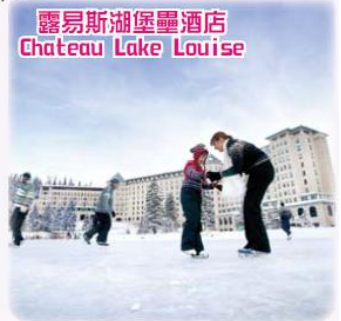
露易斯湖堡壘酒店 Chateau Lake Louise

啟程前往加國花旗蔘之都-甘露市，欣賞沿途美羅景色。此地年日照時間超過2000小時，連綿不絕的人蔘種植場隨處可見。甘露市位於南北湯普遜河之交匯點。其名稱來源於印第安語(Cumc'loups)，即河流交匯點的意思。午餐後，前往花旗蔘廠參觀，了解花旗蔘品種、生產、種植過程及選蔘方法。於黃昏時抵達溫哥華。Head west for the interiors in the morning. At Kamloops, a city with over 2000 hours of sunshine per year, we will join a tour at the Ginseng factory and learn about Ginseng's healing power. Continue our drive and arrive at Vancouver in the late afternoon.