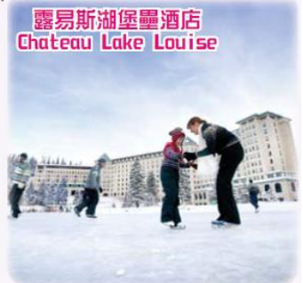
露易斯湖堡壘酒店 Chateau Lake Louise

啟程前往加國花旗蔘之都-甘露市，欣賞沿途美羅景色。此地年日照時間超過2000小時，連綿不絕的人蔘種植場隨處可見。甘露市位於南北湯普遜河之匯點。其名稱來源於印第安語(Cumc'loups)，即河流交匯點的意思。午餐後，前往花旗蔘廠參觀，了解花旗蔘品種、生產、種植過程及選蔘方法。於黃昏時抵達溫哥華。Head west for the interiors in the morning. At Kamloops, a city with over 2000 hours of sunshine per year, we will join a tour at the Ginseng factory and learn about Ginseng's healing power. Continue our drive and arrive at Vancouver in the late afternoon.