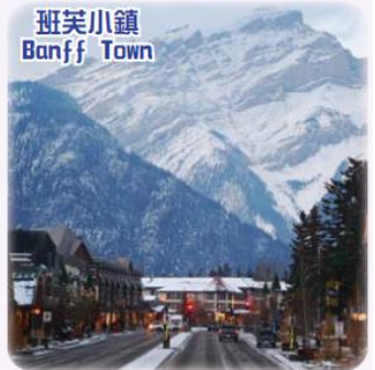
班芙小鎮 Banff Town

酒店Hotel: Prestige Salmon Arm / Vernon or similar 或同級